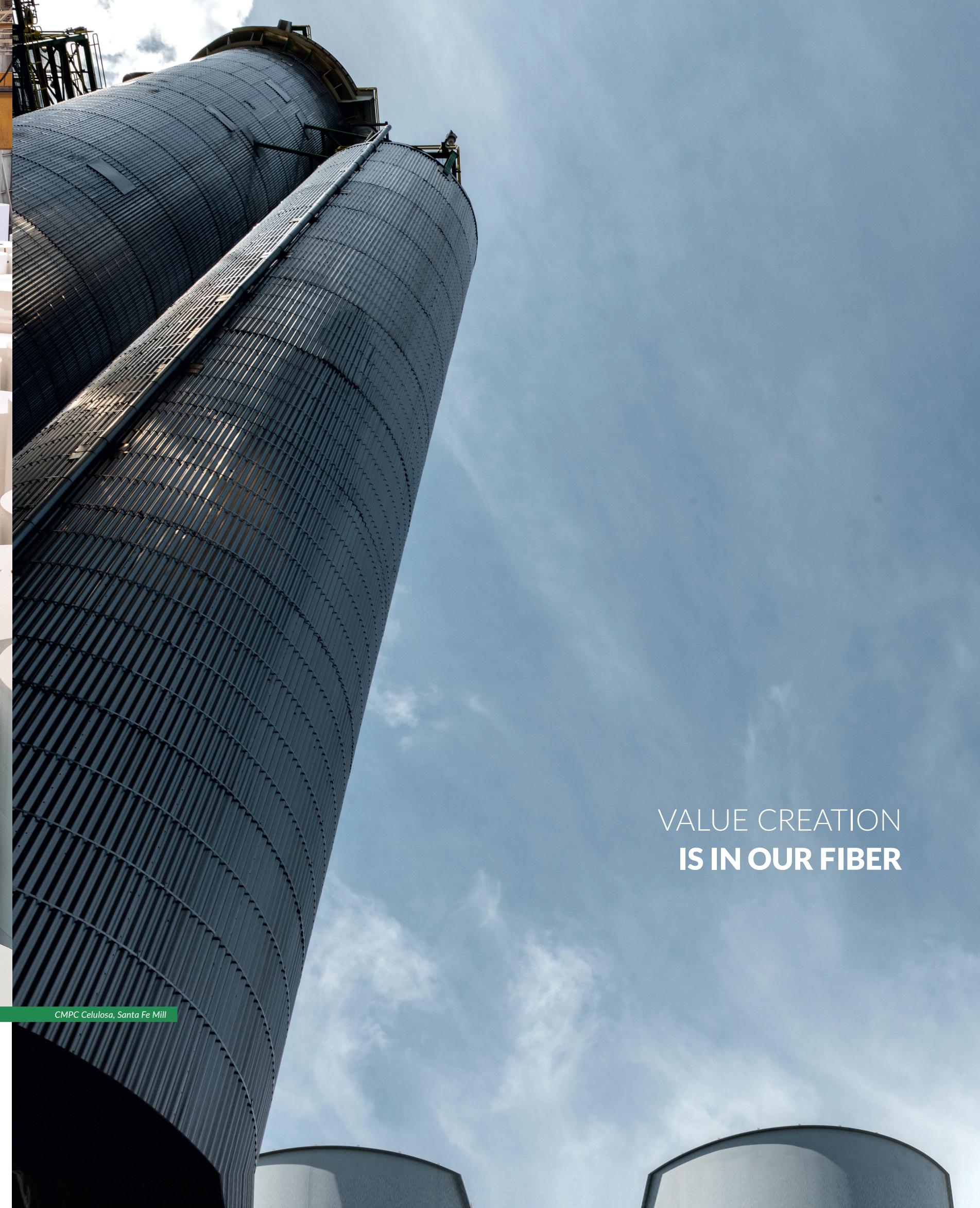
CMPC Celulosa, Santa Fe Mill