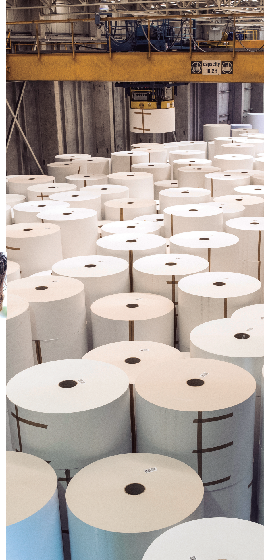
CMPC Cartulinas, Maule Plant

*Consolidated results of CMPC Celulosa and CMPC Packaging)